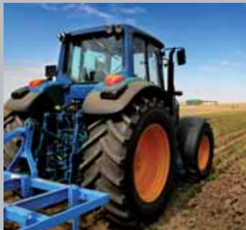
Special screw for tractors