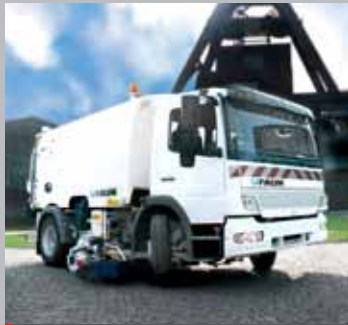
Fixing bolts for sweepers