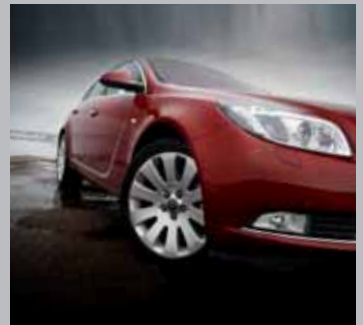
Car knuckle joints