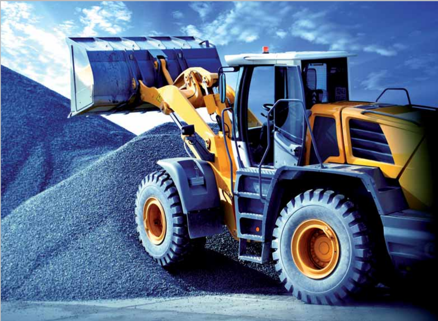
Wheel bolts for construction machines