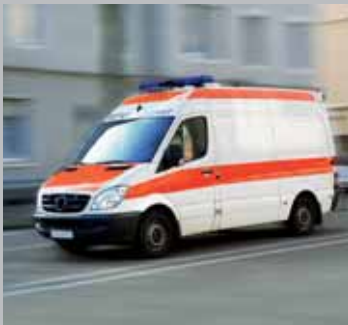
Wheel bolts for utility vehicles