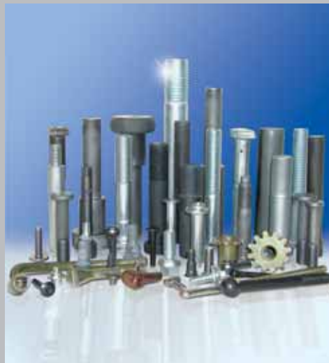
Cold formed parts