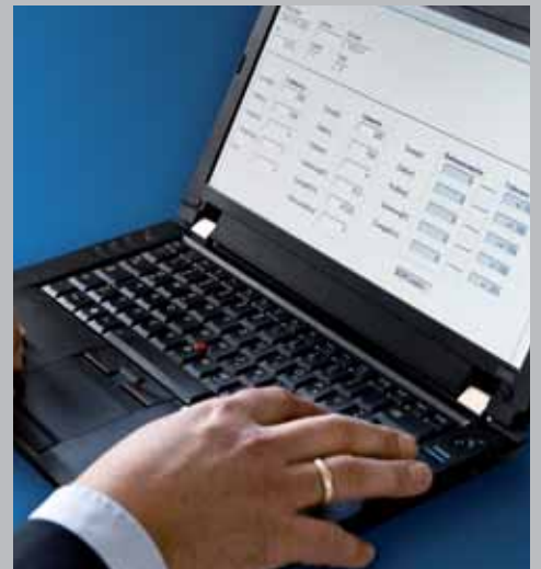
Welding data documentation