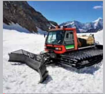
Welding pin for snow mobiles