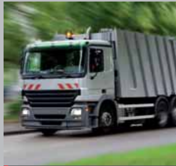
Threaded studs for truck chassis