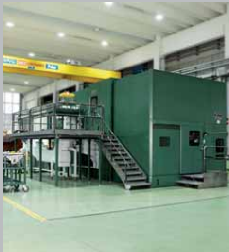
550to cold former