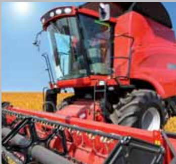
Threaded studs for harvester