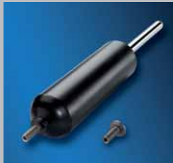
Welding studs for dampers