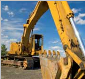
Bucket wear protection