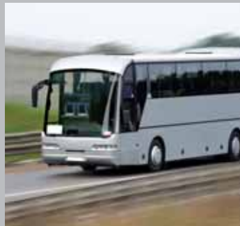
Bus wheel bolts