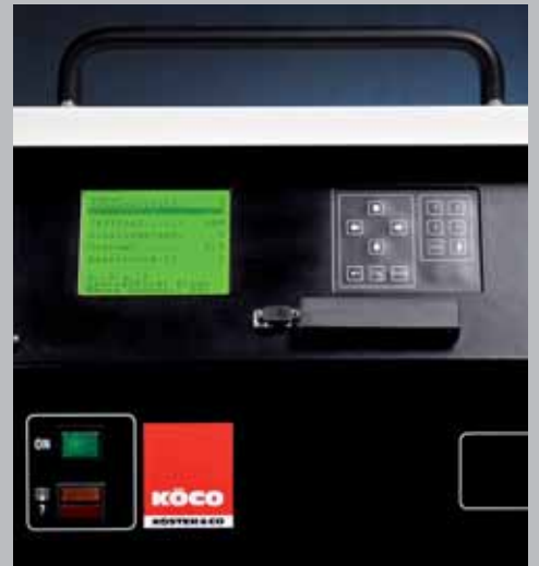
Colour display with option language select