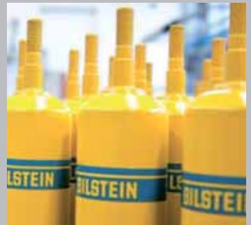
Welding pin for tuning dampers