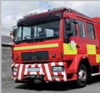
Taped studs for truck chassis